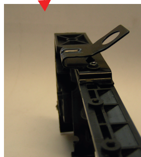
Bend this tab